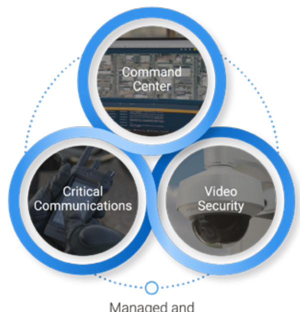
Managed and Support Services